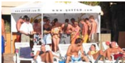
Premium Hotel Locations

Collegiate Marketing Group provides a number of unique services and strategies for companies to reach the college student demographic while on Spring Break. CMG has teamed up with the biggest and best located condos/hotels and the most popular area nightclubs to provide our clients with an unmatched capability to reach the youth market.