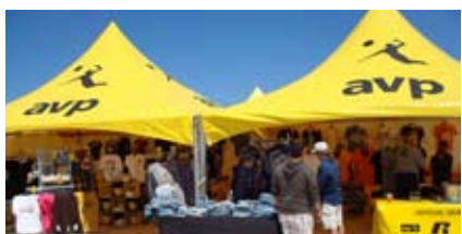
Booth / Banners