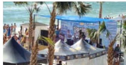
Premium Beach Locations