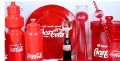
Premium Product Sampling