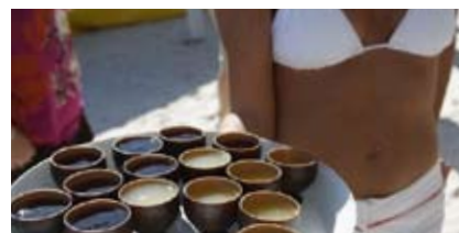
Beverage Product Sampling