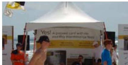
Premium Booth Set-up