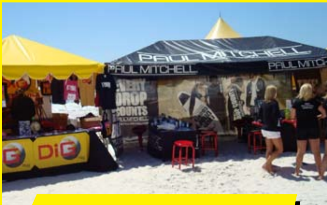
The best beach locations for the ultimate brand identity