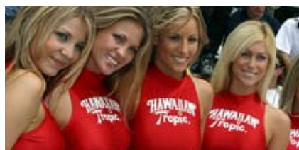
On-Site Promotion Teams