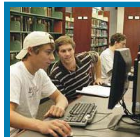
Marketing programs utilize digital media & website marketing