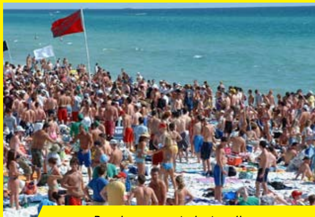
Reach a mass student audience every day of Spring Break