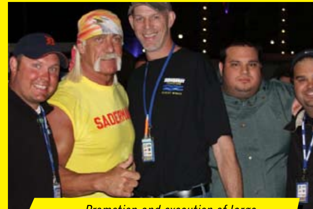
Promotion and execution of large on-site celebrity events