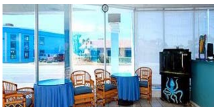
Lobby Welcome Packs