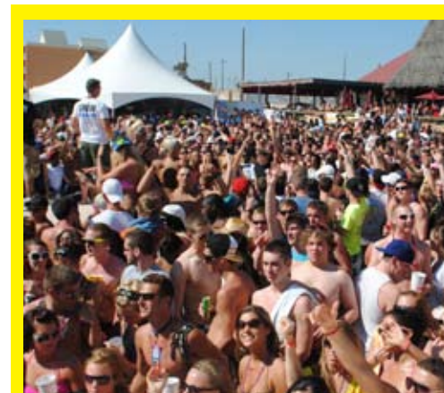
Marketing to a huge audience of student trend-setters every day

Panama City Beach, FL is the #1 Spring Break destination in the world. Each year over 500,000 students flock to Panama City Beach. In addition to working on a tan and doing a little partying, these students that travel to Spring Break are the same students that set trends on college campuses nationwide. This popular event gives our corporate clients an opportunity to reach their target audience and get their message or brand in front of a huge group of student influencers.